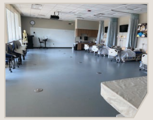
New Nurse Aide and Physical Therapy Assistant classrooms built for growth of both programs