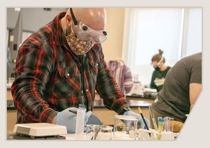
Spring 2020 and Fall 2021 Student's utilizing Sturm Collaboration Campus technology